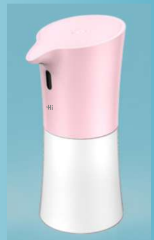
HG-001P (Rose Gold)